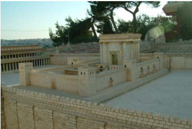
model of temple; see Solomon’s Porch at left